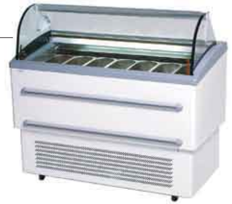
GD0007F Angle Top Curved Glass - 7 Tub Fan Assisted

This Gelato display offers an attractive solution for display of fine ice creams and gelato. The ventilated, forced air 'frost free' refrigeration system ensures a stable and constant temperature.