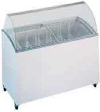
GD0007S/Slim Angle Top Curved Glass - 7 Basket Static

These Gelato displays offer an attractive solution for display of fine ice creams and gelato. The units can be decalced ( additional charges apply POA )