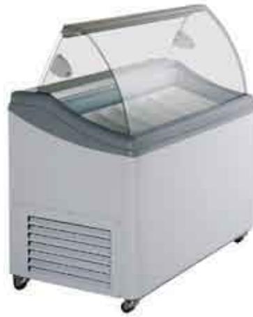
GD0007S Angle Top Curved Glass - 7 Tub Static