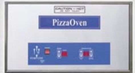
Easy to use — set and forget operation. User-friendly control board