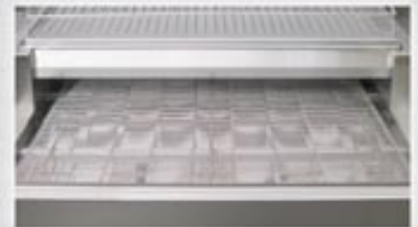
Longer and wider cooking chamber for more output