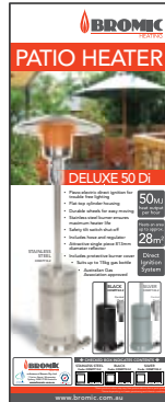
All Patio Heaters supplied in attractive retail packaging.