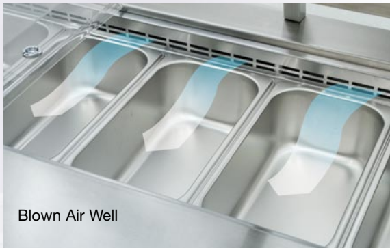
Blown Air Well