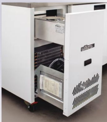
Removable cassette simplifies cleaning