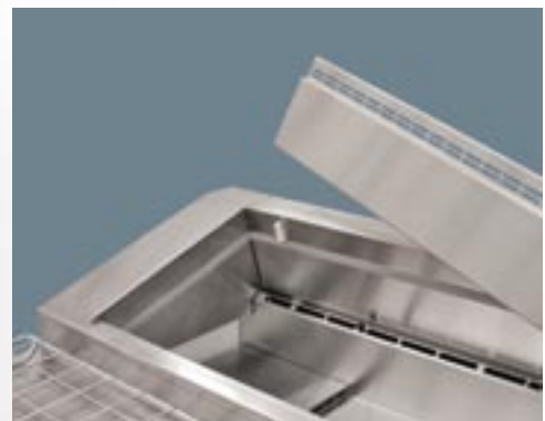
Removable blown air ducts for easy cleaning