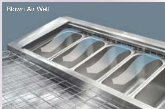
Blown Air Well

Williams Easy Clean features... ...see overleaf