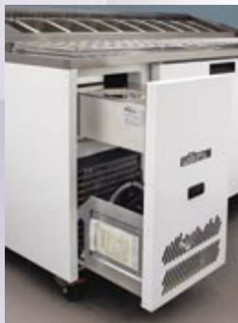
Removable cassette simplifies cleaning

We reserve the right to change the specification without notice.